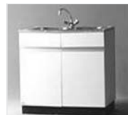
38051 Rental sink unit (Similar model shown)

Please note on the use of commercial dishwashers: The use of commercial dishwashers with a rinse cycle of two minutes or less and the preparation or demonstration of products containing grease and/or oil requires the use of grease traps for the wastewater being discharged (see order form 5.8) (see also "Water connection and supply terms" on page 3).